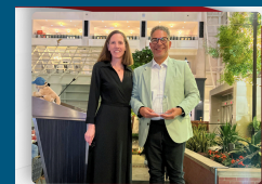
OUTSTANDING CONTRIBUTION TO DISASTER RELIEF CONTINENTAL LOGISTICS