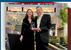
OUTSTANDING CONTRIBUTION TO DISASTER RELIEF PARTNER'S WAREHOUSE