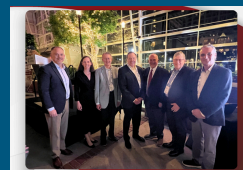
LIFETIME ACHIEVEMENT AWARD ALAN FOUNDERS