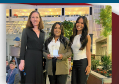
EMPLOYEE ENGAGEMENT AWARD NIAGARA CARES

"Each of these recipients exemplifies what selfless logistics is all about – all while reminding us of the incredible good the supply chain community can do," Fulton said. "We're thankful for their generosity, inspired by their example, and honored to give them the recognition they so deeply deserve."