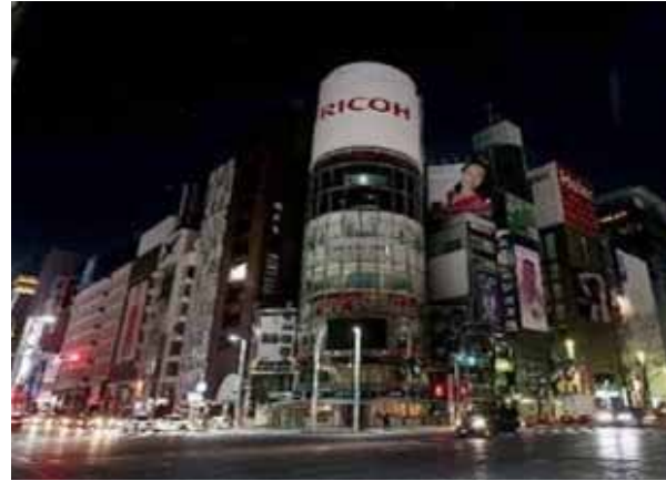
Ginza District in Tokyo before and during rolling blackout

As the news of the devastation spreads across the nation and the world, most normal daily activities stopped. Many businesses released their employees to return home but the trains, the main form of transportation, were not working. Further devastation occurred just after midnight when a dam broke in the Fukushima prefecture flooding the area and causing significant damage as the nation continued to experience strong aftershocks. Concerns were now mounting about the critical situation at the Fukushima Daiichi Plant as the nation focused on search and rescue in the tsunami area.